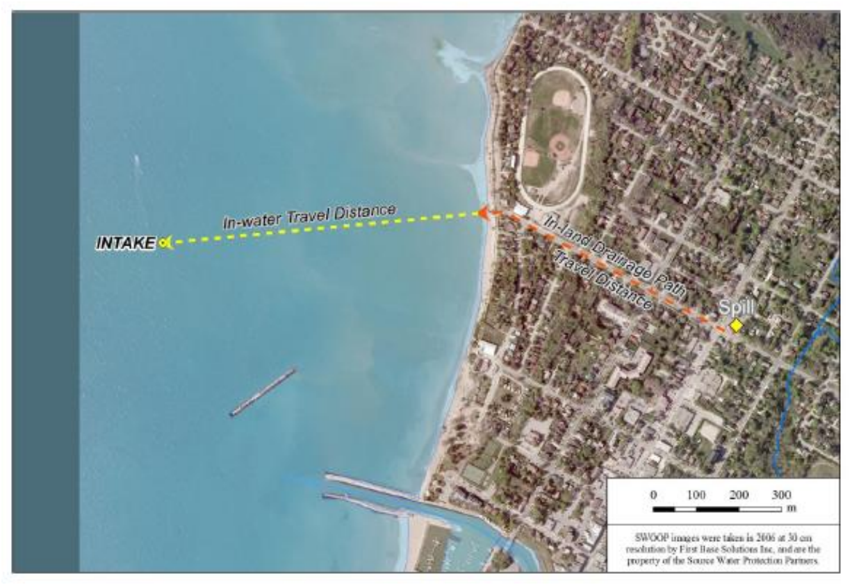
Figure 4.1.3 – Assumed Drainage and In-water Travel Paths for Desktop Assessment

Desktop analysis done by Baird determined that none of the possible sewage spill scenarios resulted in a predicted exceedance at the intake. Fuel spill exceedances were predicted for Lion's Head, Wiarton, Owen Sound, Meaford, Southampton and Kincardine (Table 4.1.7).