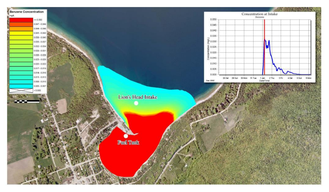
Figure 4.1.1 – Pollutograph for Lion's Head Marina Spill (Baird, 2013)

For limitations on spill modelling, see section 3.6 of IPZ-3 Modelling for Identification of Significant Threats Saugeen, Grey Sauble, Northern Bruce Peninsula Region (Baird, 2013).