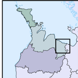
MAP 4.2.M3 HIGHLY VULNERABLE AQUIFER VULNERABILITY

HVA Vulnerability delineated by DWSP staff using the ISI.