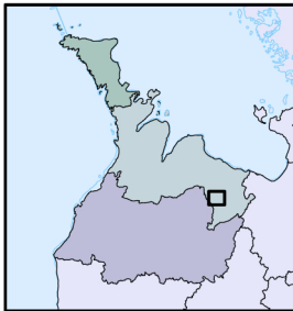
MAP 4.5.E1.7 LIVESTOCK DENSITY, WHPA-E - KIMBERLEY

Base mapping produced under license with the Ontario Ministry of Natural Resources © Queen's Printer for Ontario, 2009. The use of these data does not constitute an endorsement by the MNR or the Ontario Government of such data.