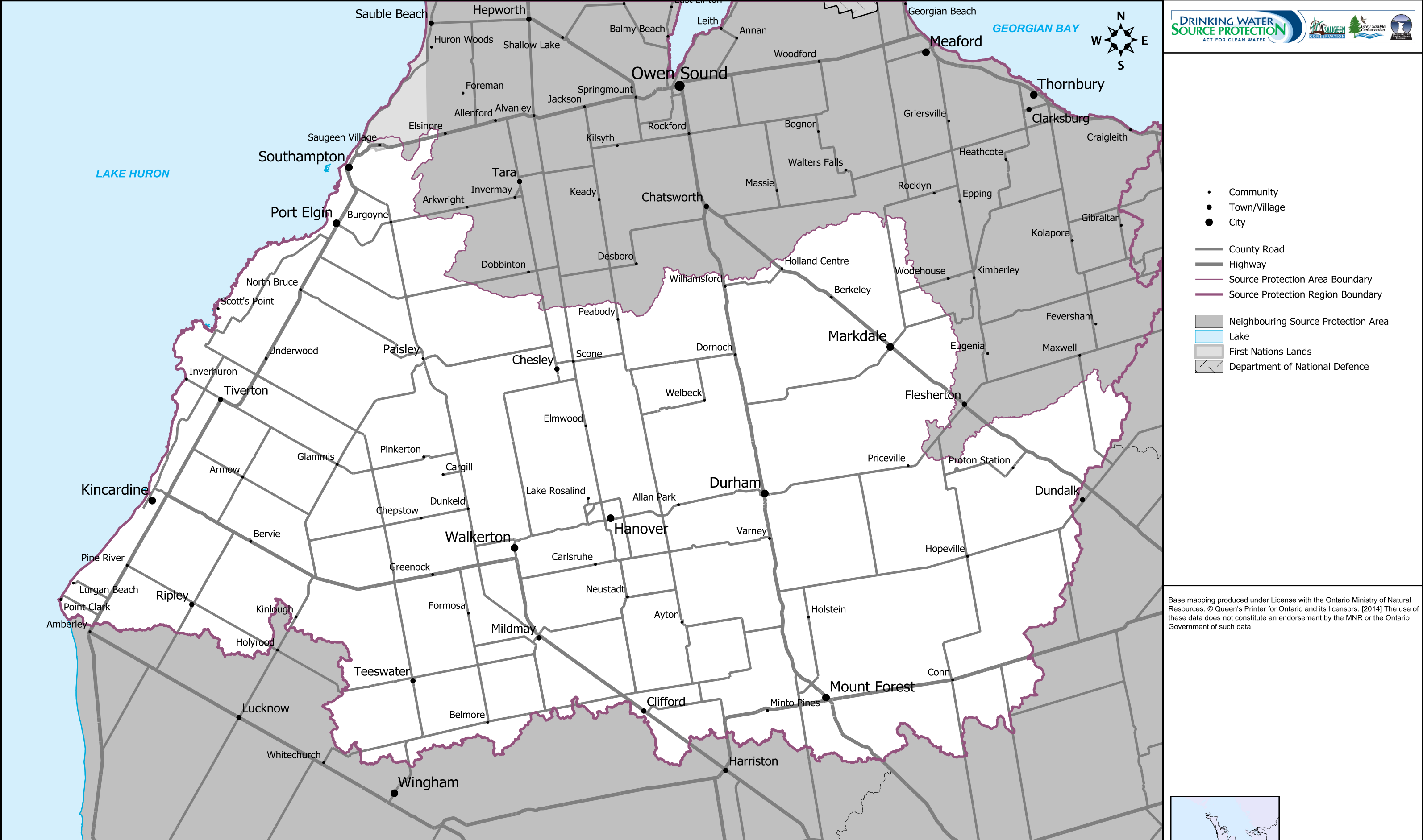
MAP 2.2 SETTLEMENT AREAS AND COMMUNITIES