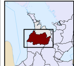
MAP 3.4 OVERBURDEN THICKNESS

Overburden Thickness - Waterloo Hydrogeologic for the Ontario Ministry of the Environment: Southwest Region Edge-Matching Study, 2005 AND Golder & Associates: Wellington County Groundwater Study, 2006 - NOTE: Overburden Thickness data from Wellington County has not been edge-matched with Waterloo Hydrogeologic data to create a seamless dataset. Therefore, variations in data values are evident between the two study boundaries.