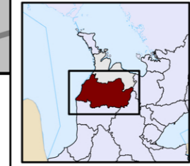
MAP 3.7 PERMITS TO TAKE WATER - SURFACE

Base mapping produced under license with the Ontario Ministry of Natural Resources © Queen's Printer for Ontario, 2009. The use of these data does not constitute an endorsement by the MNR or the Ontario Government of such data. Permits to Take Water - Ontario Ministry of the Environment (Permits displayed are current to January 1, 2008).