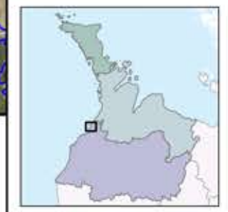
MAP 4.9.S1.8 EVENTS-BASED AREA - SOUTHAMPTON

Data supplied under Licence by Members of the Ontario Geospatial Data Exchange. © Queen's Printer for Ontario and its licensors. [2010] May Not be Reproduced without Permission. THIS IS NOT A PLAN OF SURVEY.