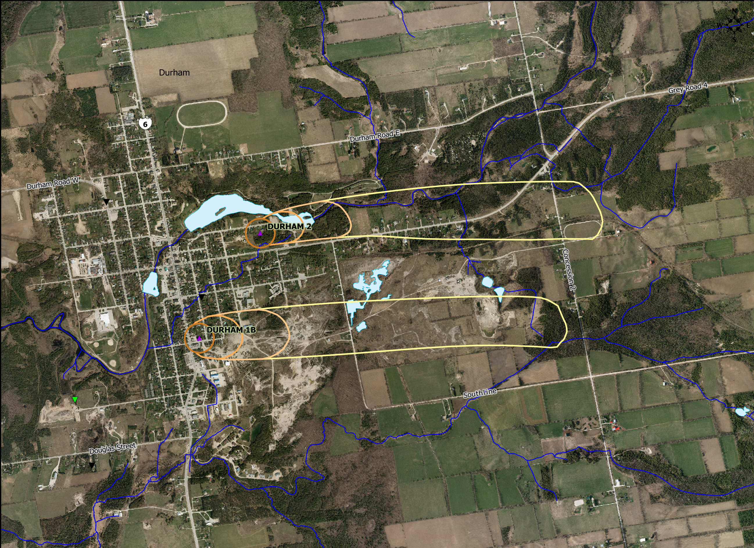
MAP 4.13.G1.2 WELLHEAD PROTECTION AREA - DURHAM Water Quality - Municipality of West Grey